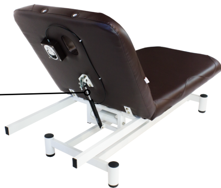
Table paper holder included