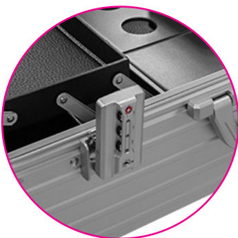
Secure Locking Mechanism

Portable Design: A built-in rolling stand with wheels makes for effortless transport, while comfortable handles offer carrying flexibility. Secure locking mechanisms keep your makeup secure.