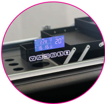
Room Temperature Display