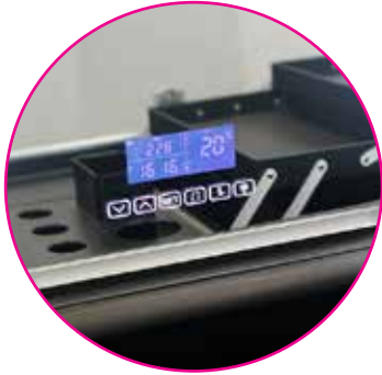
Room Temperature Display